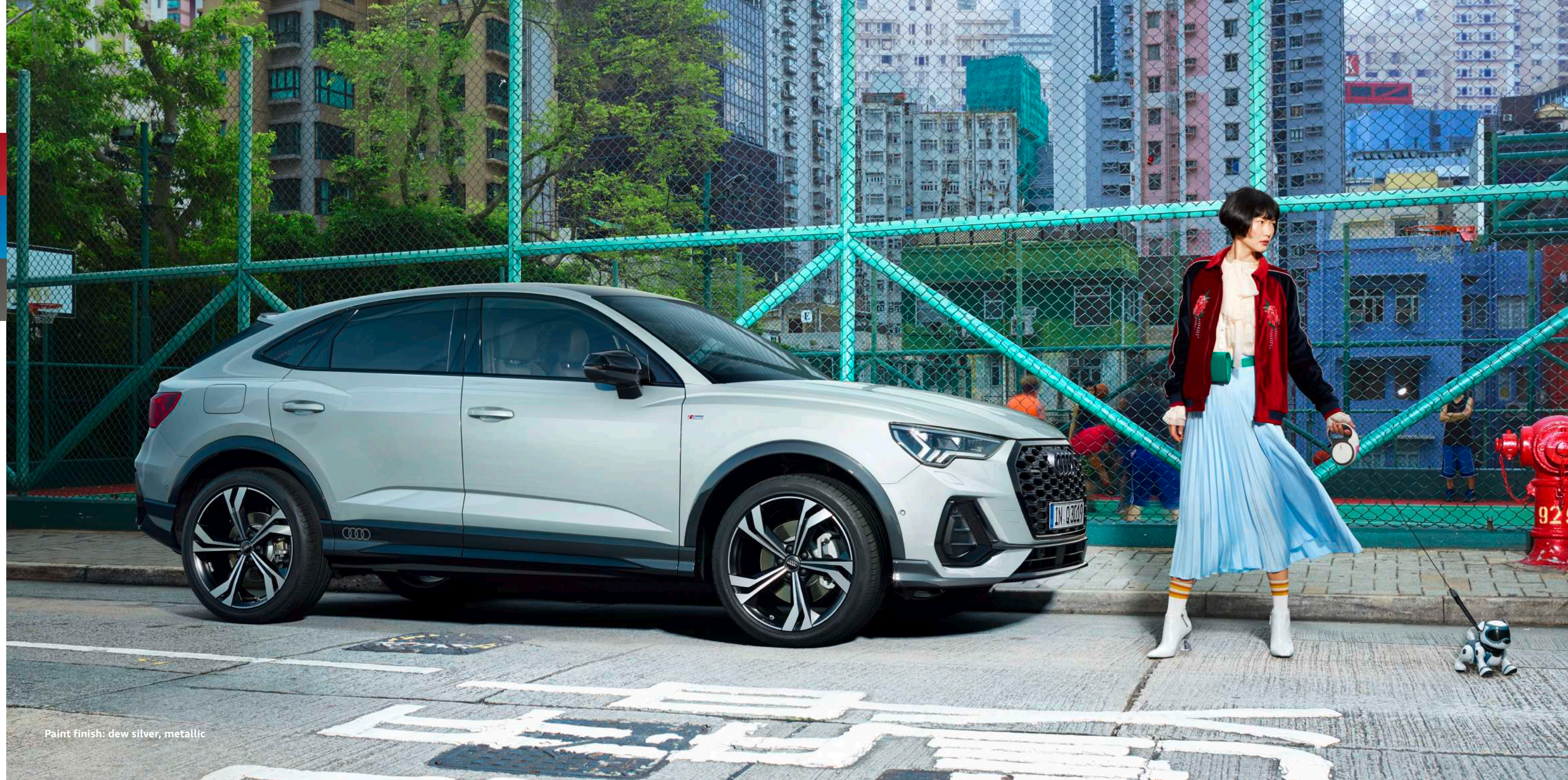
Paint finish: dew silver, metallic