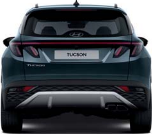
Wheel Tread* 1,622

Unit : mm * Wheel tread • 17" Wheel (Front/Rear) : 1,630/1,637 • 18" Wheel (Front/Rear) : 1,615/1,622 • 19" Wheel (Front/Rear) : 1,615/1,622