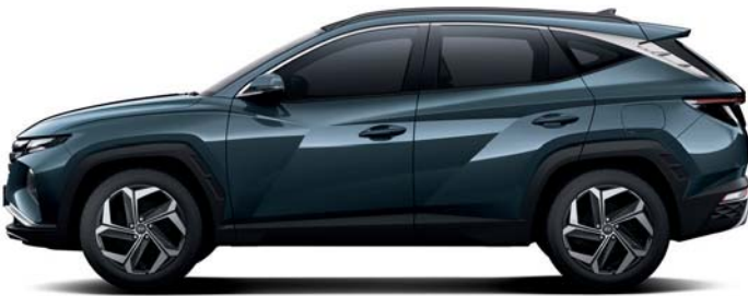
Overall Length Wheel Base