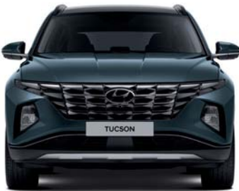
Overall Width Wheel Tread*