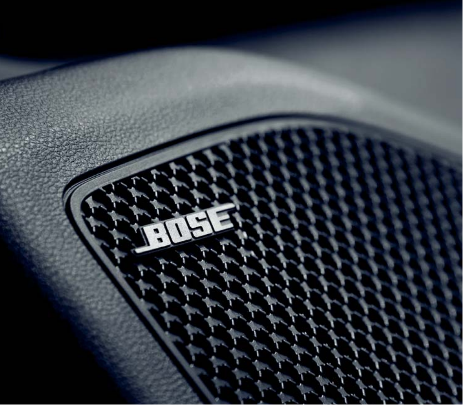
Bose premium audio