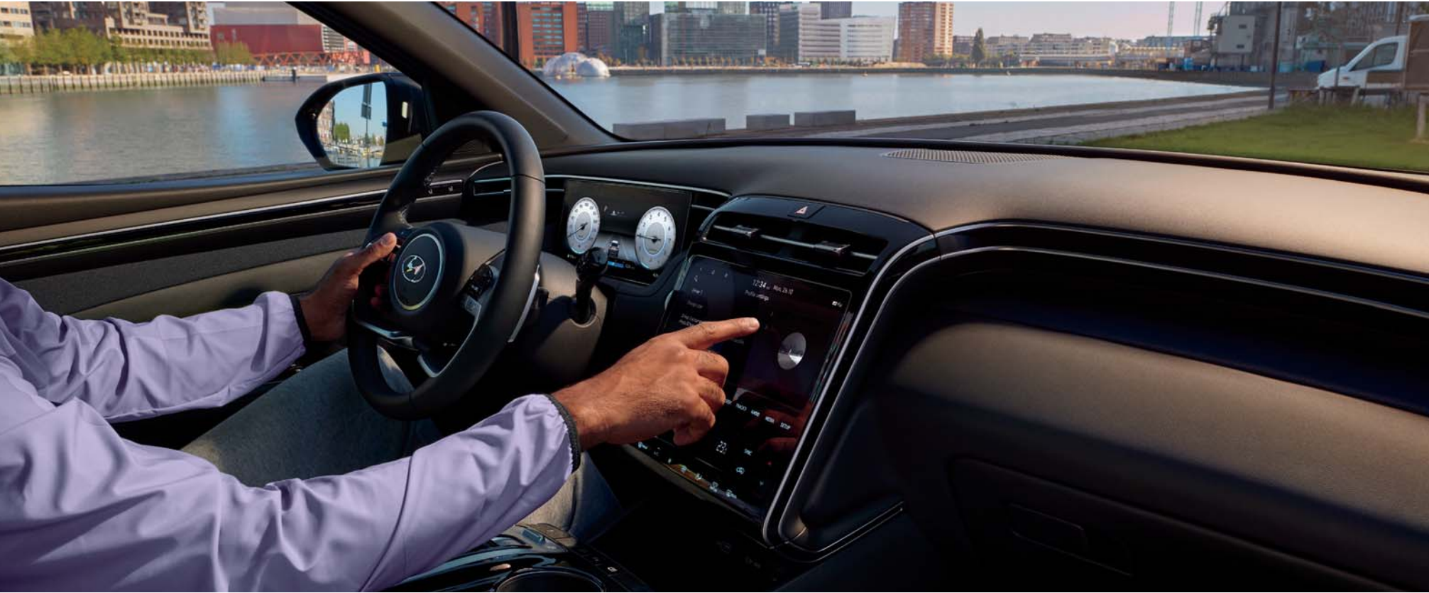
Full-touch center fascia (Personalized profiles)