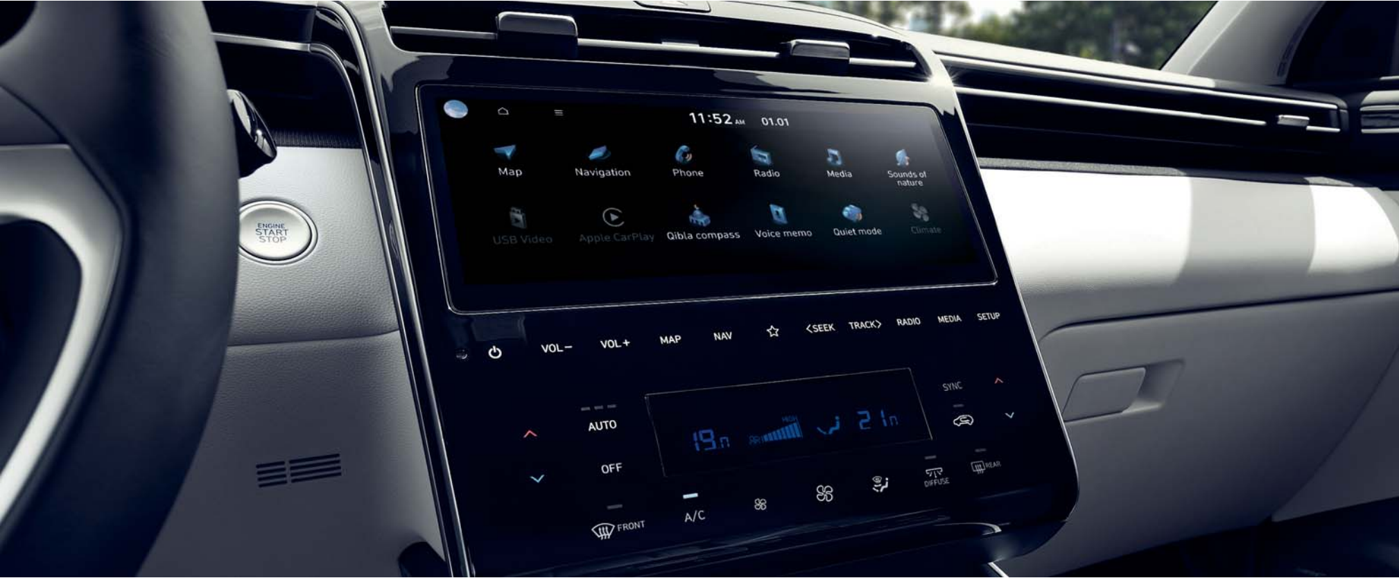
10.25" LCD touchscreen