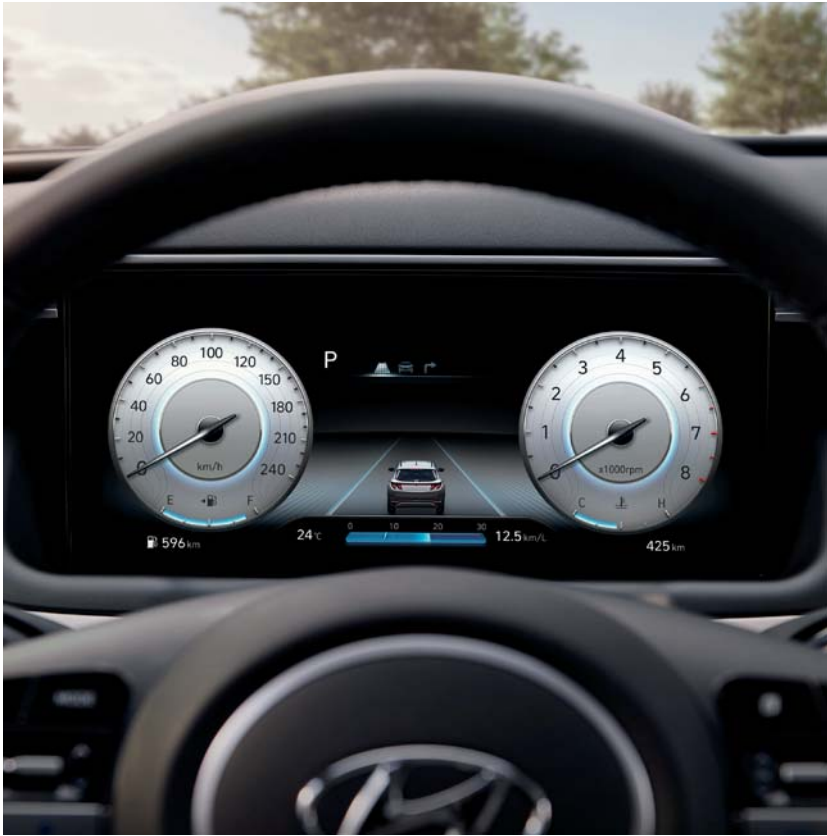
10.25" open cluster