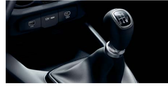
5-speed manual transmission

Unsurpassed for simplicity, economy and pure driving fun, this standard gearbox delivers buttery-smooth shifting and has a clutch pedal that is light and precise.