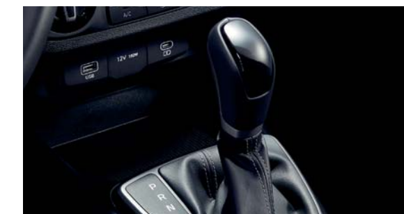
4-speed automatic transmission

Unsurpassed for simplicity, economy and pure driving fun, this standard gearbox delivers buttery-smooth shifting and has a clutch pedal that is light and precise.