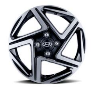
15" Alloy wheel