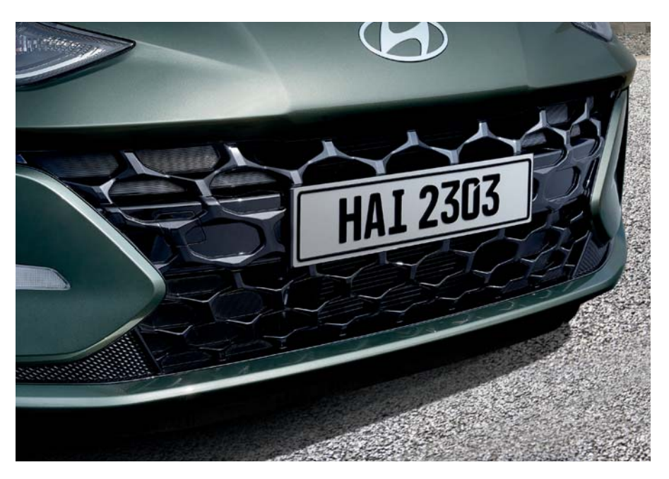
Glossy black radiator grille