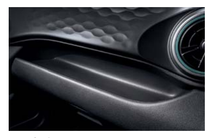
Practical storage area