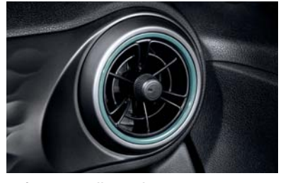
Unique propeller-style AC vents