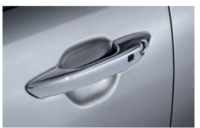
Chrome-coated door handles