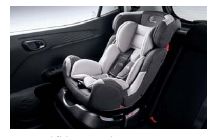
ISOFIX child seat anchor system