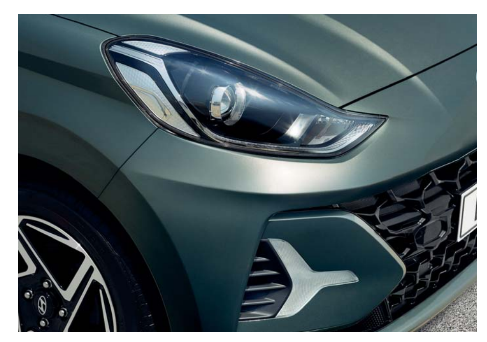
Projection headlamps / LED Daytime Running Lights (DRL)