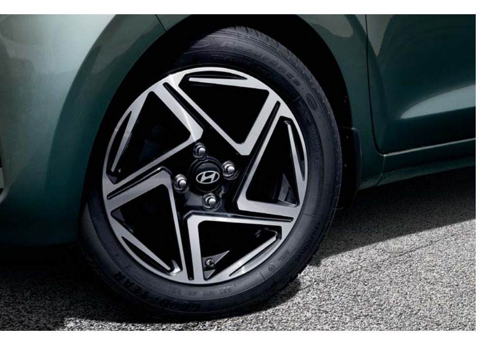
15" alloy wheels