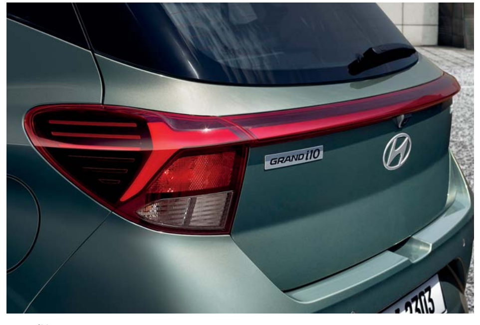
LED tail lamps

Grand i10 gets you started on your next road adventure in bold, exciting style. Every details amplifies the driving fun factor. It sports edgy-looking 15-in alloy rims, and a larger, bolder glossy black radiator grille that commands instant attention. LED-lights add a note of high-tech sophistication while the two-tone paint treatment creates a distinctively modern appearance.