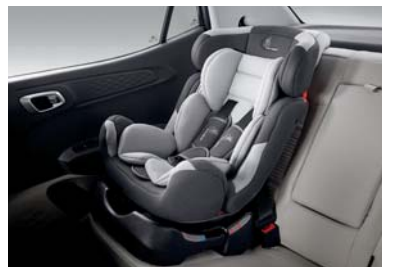
ISOFIX child seat anchor system