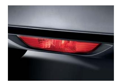
Rear fog lamps