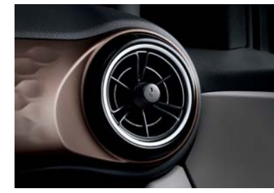
Unique propeller-style AC vents