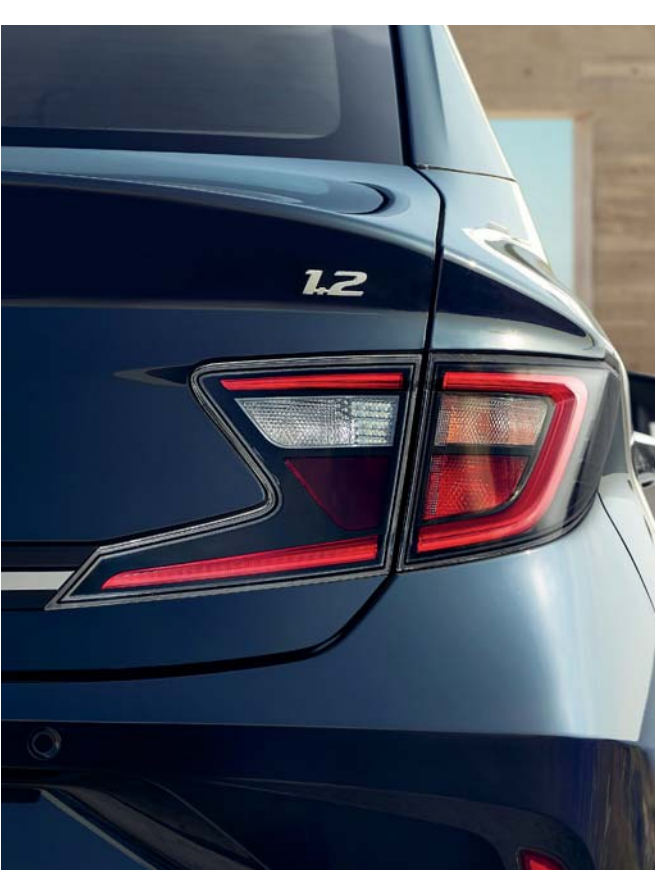
Stylish Z-shaped LED tail lamps