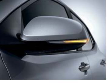
Outside mirrors & repeaters