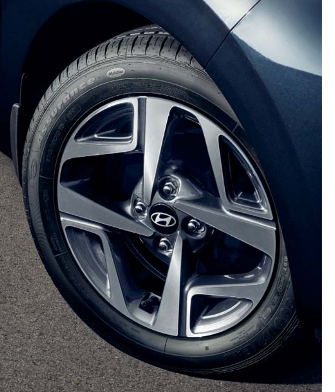
15-in Diamond-cut alloy wheels