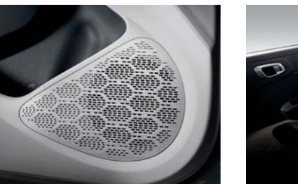
Front / Rear four-speaker system