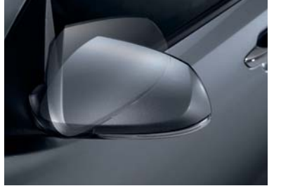
Electric folding mirrors