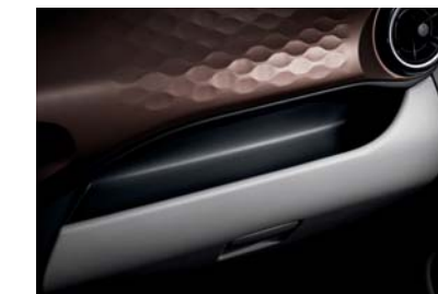
Practical storage area