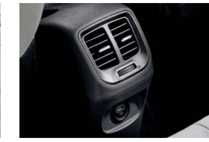
Rear AC vents