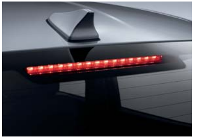
High-mounted stop lamp (LED)