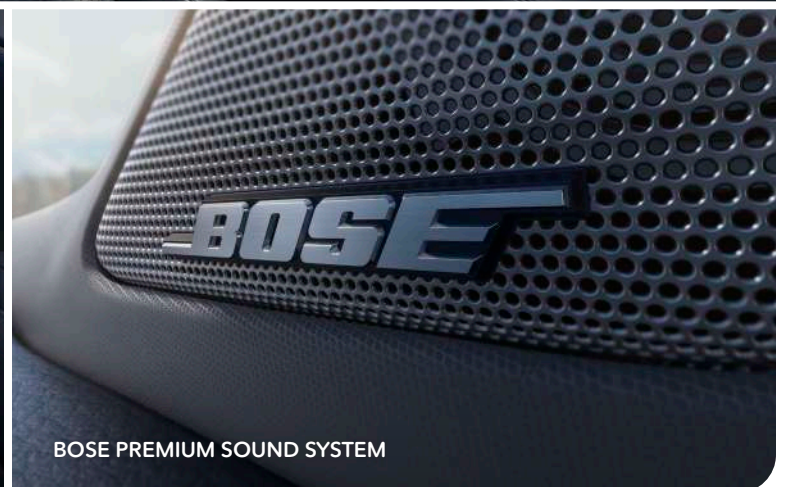
BOSE PREMIUM SOUND SYSTEM