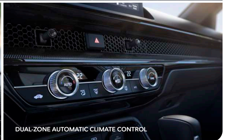
DUAL-ZONE AUTOMATIC CLIMATE CONTROL