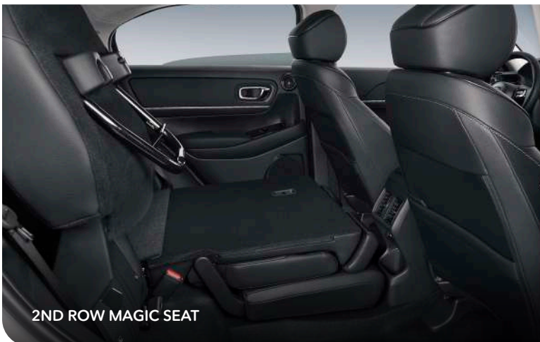
2ND ROW MAGIC SEAT