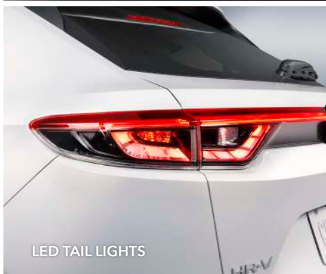
LED TAIL LIGHTS