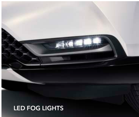
LED FOG LIGHTS