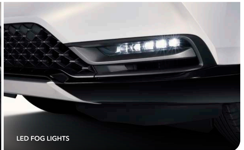
LED FOG LIGHTS